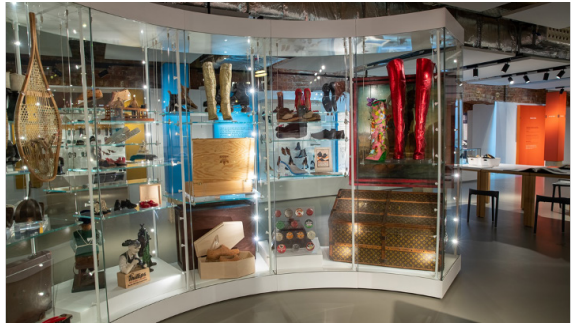
The shoe gallery at the Northampton Museum and Art Gallery. A pair of the original W.J. Brookes boots can be seen in the top right.

having difficulty finding a manufacturer that could reliably provide her with high-heeled shoes that could comfortably be worn by male and AMAB customers. Manufacturers usually took between six to eight months to fill orders and the boots were usually of a lower quality. Not only that, but they were not always guaranteed to fit – manufacturers used standard women’s sizes and scaled them up to fit men’s feet, which proved to be a faulty system.